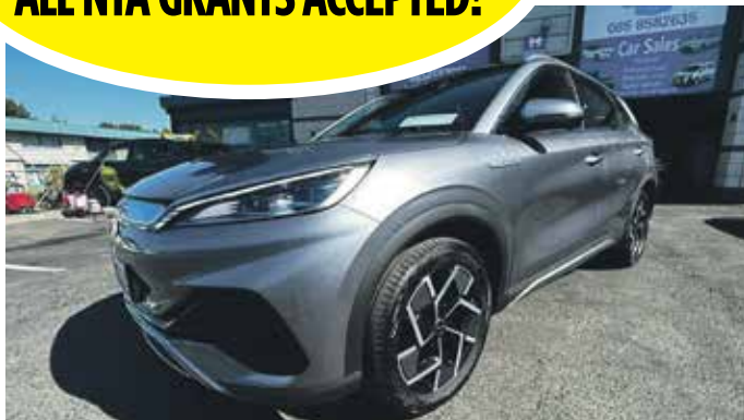
Byd Atto 3 / 2023 / Full Electric / TAXI GRANT

FINANCE DEALS AVAILABLE ALL NTA GRANTS ACCEPTED!