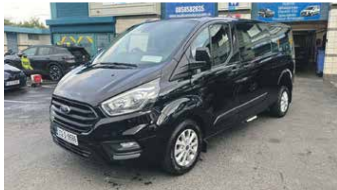
Ford Transit / 2023 / 8 Seater / Auto / Wheelchair