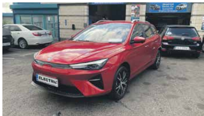
MG 5 Exclusive/2023/Electric/ Long Range/Taxi Grant

O'Sullivan Motors Unit 9, Tolka Valley Business Park, Ballyboggan Road, Dublin 11