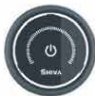
White color Start to work