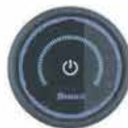
Dark Blue Clean done