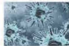
Bacterial and Virus