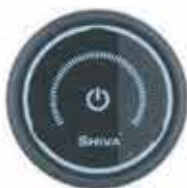
Light Blue Clean process