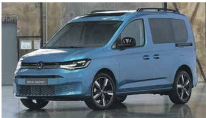
Volkswagen Caddy / 2023 / 2.0 Diesel / Auto